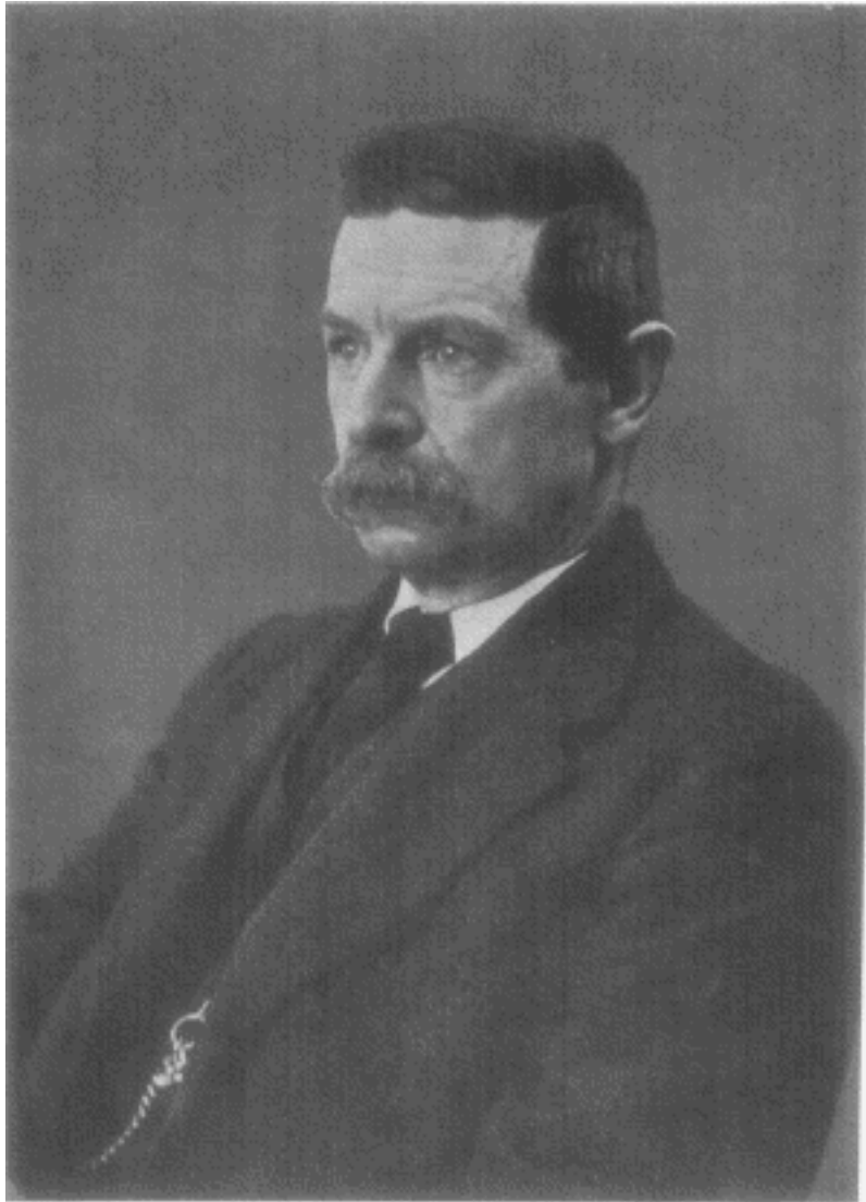
EDWARD R. PEASE, IN 1913