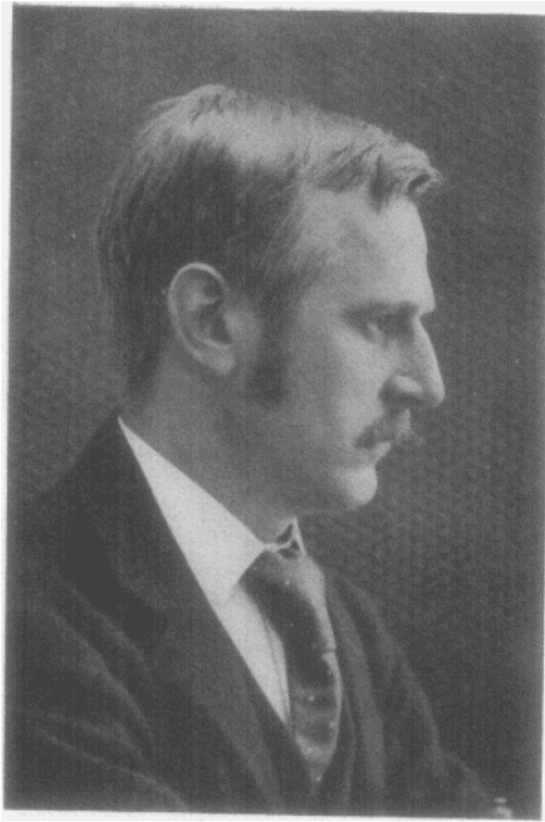
GRAHAM WALLAS, IN 1891